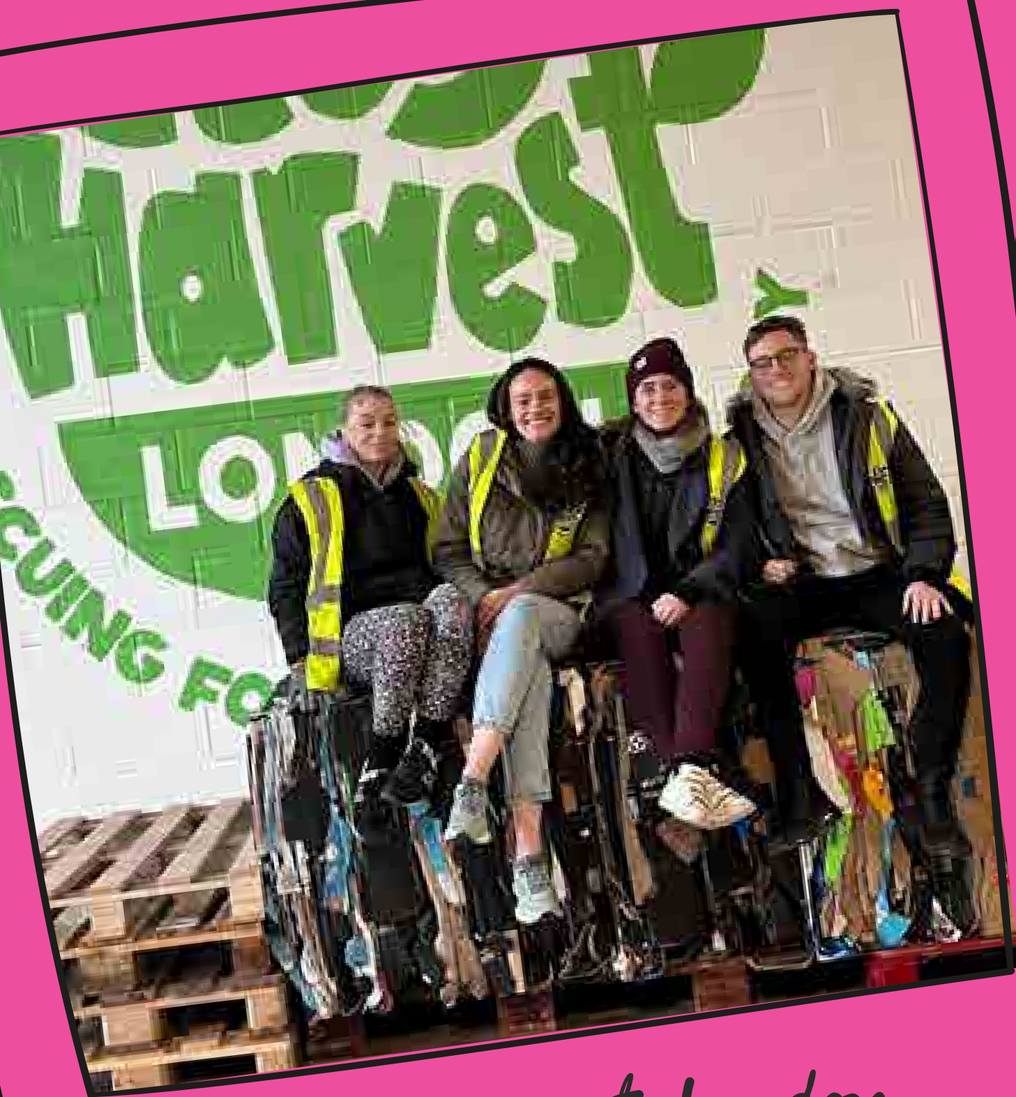
City Harvest, London

Our team did over 500 hours of volunteering. We worked with food charities to stop over 200kg of excess food going to landfill.